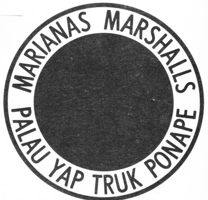
Back of Medal

to be presented to the first place (gold), second place (silver) and third place (bronze) finishers in each event of the Games.