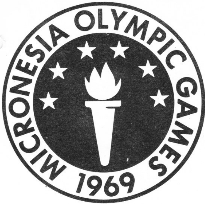
Front of Medal